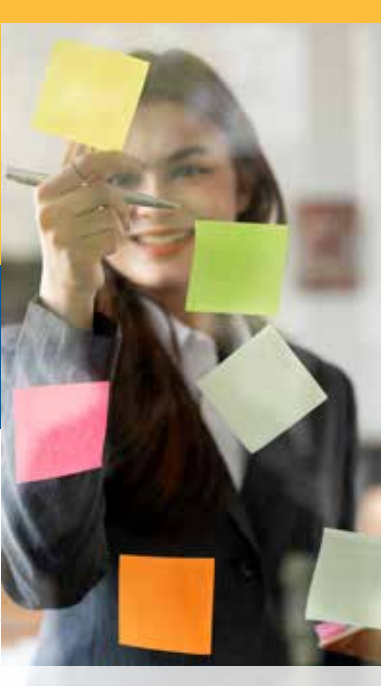
START A BUSINESS